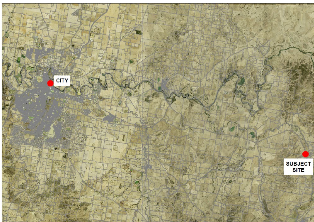
Figure 1 – Site location

The site is located approximately 41 kilometres east of Wagga Wagga on the Sturt Highway. The site's location is shown in Figure 1.